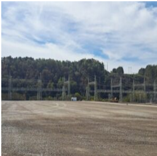
Placed the 825-B Stone in basement

We appreciate the opportunity to be of service to you on this project. If you have any questions regarding this report, please feel free to contact us. We will be more than happy to discuss it with you.